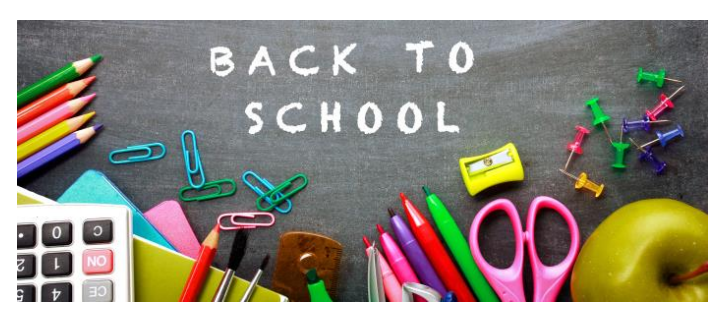
Brought to you by your Clay Student Services Department http://www1.ccs.k12.in.us/clm/Counseling